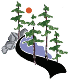
The Gunflint Trail Historical Society

The above information was created and used with permission by the Department of Natural Resources.